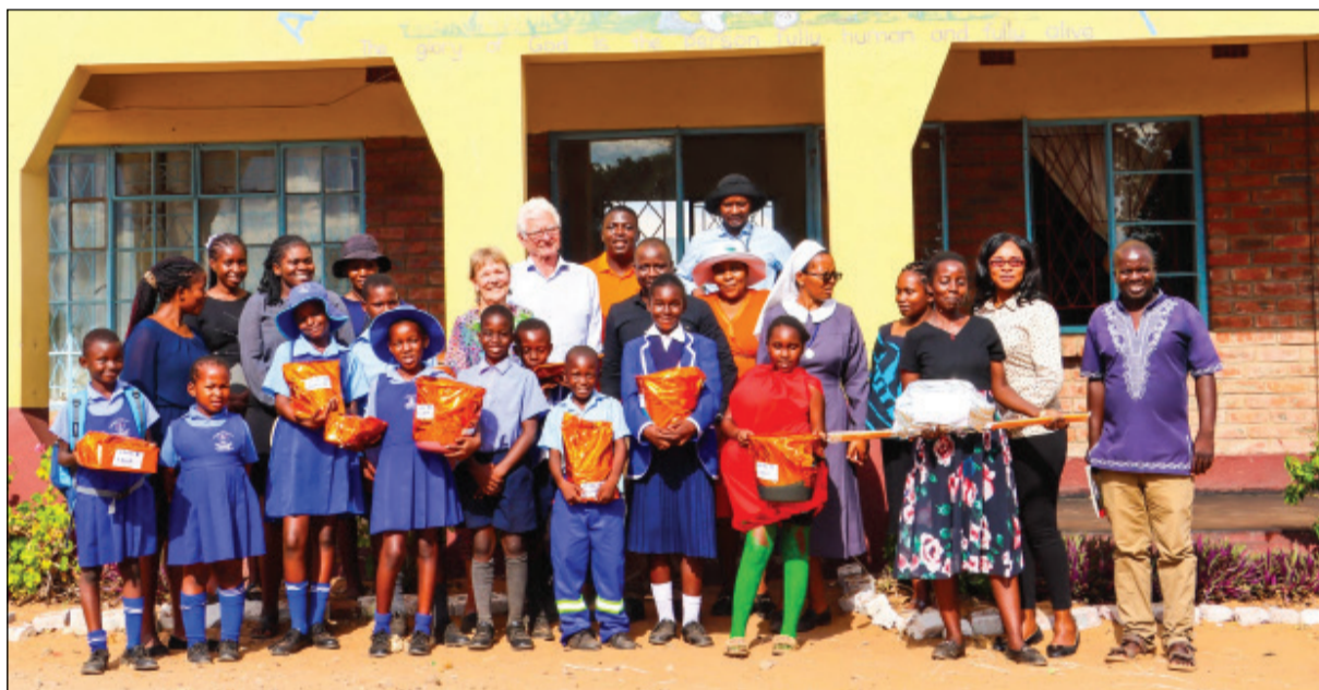
Overall winners from AMR Sisters Primary