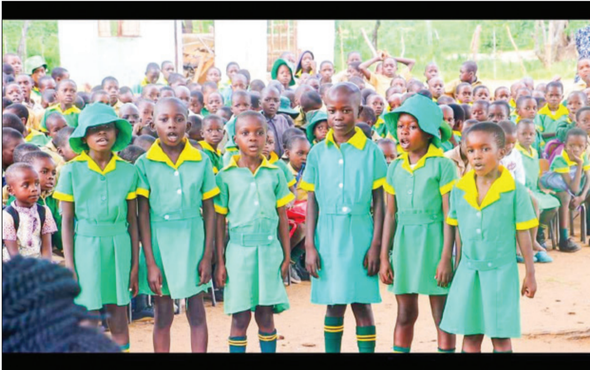
Ndlovu Primary School students making their presentations

Tshongokwe Primary School has also reported significant progress, with the school receiving two piglets from ZIMFEP, which have increased to 11 pigs. The school garden has had three cycles of crops, including tomatoes, green vegetables, choumoellier, and rape. The school currently has good green maize, which was on sale during a