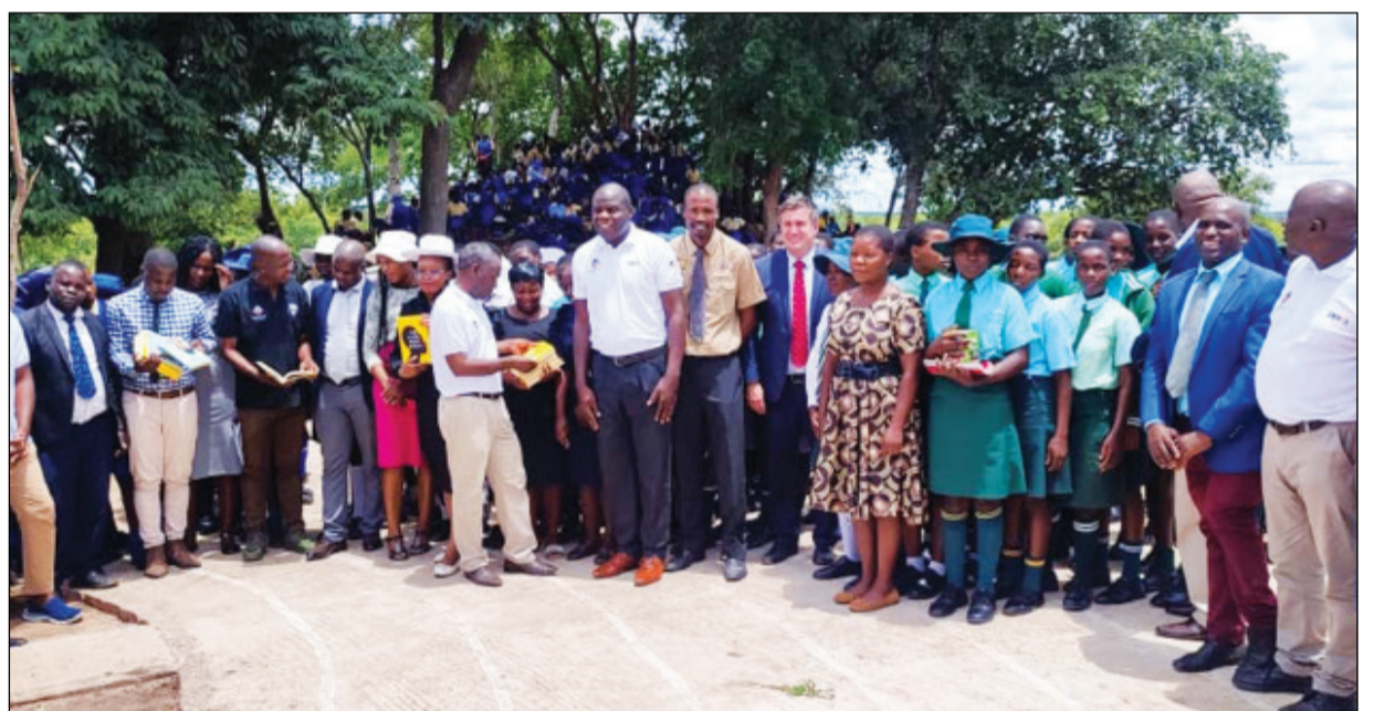
US Embassy delegates, Lupane State University (LSU) leaders, primary school teachers, and learners poses for a photo