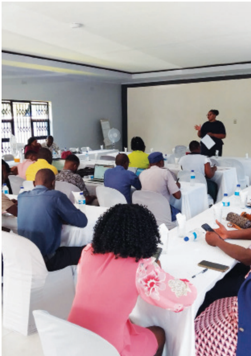
Proceeding during the meeting.

This comprehensive partnership is expected to have a significant impact on the lives of young people in the region, providing them with access to valuable information, skills, and training.