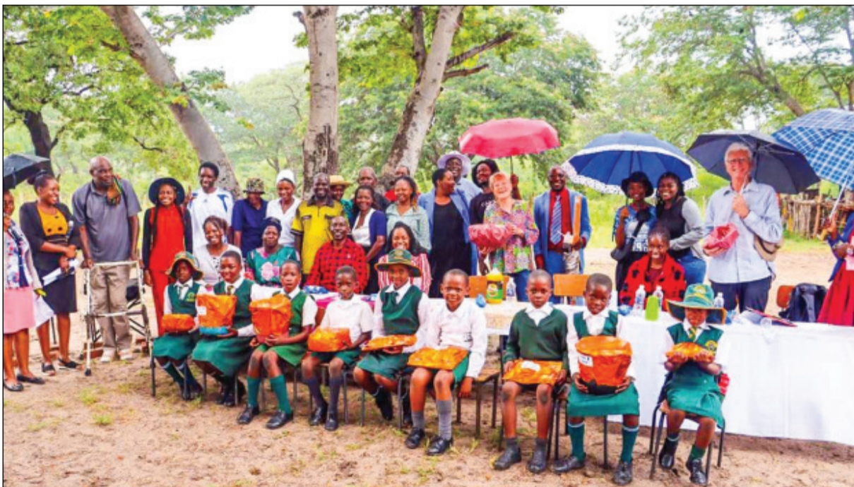
Overall winners at Ndlovu Primary School

recent visit, with a target harvest of 400 dozen.