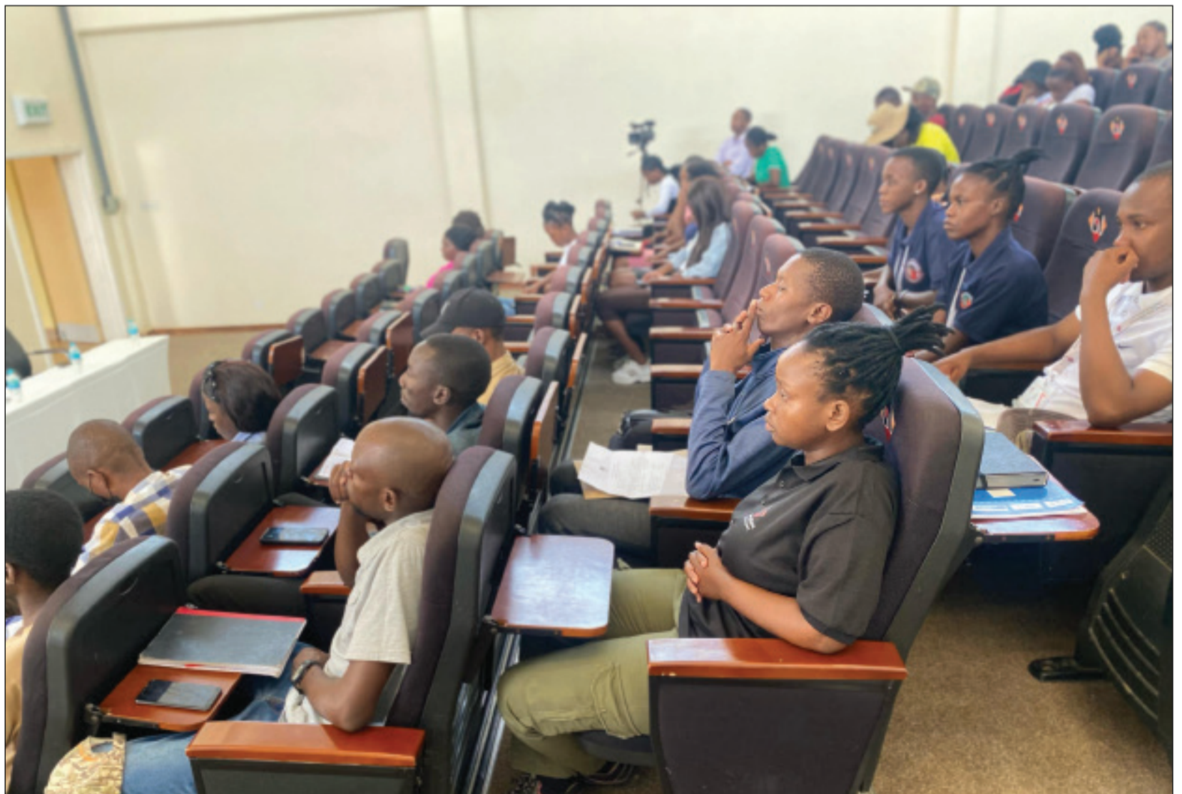
Proceeding during the Wildlife Day commemorations

The public lecture served as a platform to raise awareness about the importance of wildlife conservation finance and the need for collective action to protect the world's biodiversity.